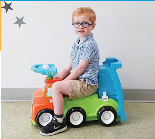
Hunter Corcoran, brain tumor survivor.