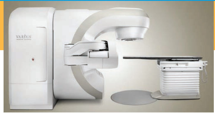
Justin, at left, a healthy survivor whose brain tumor was treated with chemotherapy and, later, radiation therapy using our True Beam Accelerator, pictured at right.