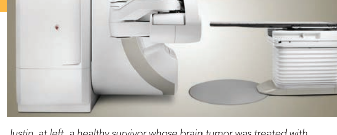
Justin, at left, a healthy survivor whose brain tumor was treated with chemotherapy and, later, radiation therapy using our True Beam Accelerator, pictured at right.